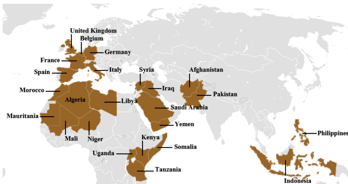
Infographic

However, it has lost its formerly-enjoyed grip on large parts of Iraq, and is engaged in a turf-war with the IS (the erstwhile al Qaeda in Iraq and then the Islamic State of Syria and the Levant) for control in Syria. Among the key reasons for the allies' continuing loyalty to al Qaeda – apart from the long-standing nature of relationships, ideological affinities, and the acceptance of Afghan Taliban leader Mullah Omar as the Amir-ul-Momineen – is the phenomenon of 'bin-Ladenism' that is slowly becoming apparent. 32