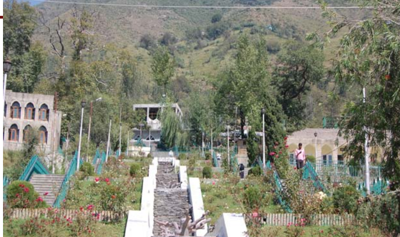
Symbol of Communal Harmony: Shahdra Shrine near Rajouri

Recently during February-March 2010, the local police organized Volley ball matches, which were a huge successes in these two districts. Besides such well known sports and activities, this region has certain secular events, peculiar to this region, including wrestling, 'stone lifting' and 'wrist holding'. Though the state has supported some of these events as part of the region's rural sports culture, especially among the youth, these activities could