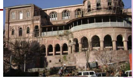
Along the Mughal Road: The Forts & Sarais of Chingus (Left), Thanna Mandi (Middle) & Poonch (Right)

Amarnath yatri into this region. The recent torching of shops in Poonch during the Amarnath Shrine land allotment controversy is also viewed by the Muslim community as a Hindutva agenda to polarize the community along regional lines.