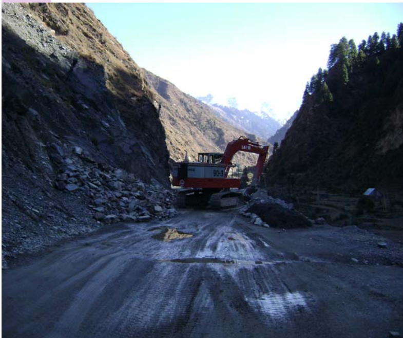
Under Reconstruction: The heritage Mughal Road across the Pir Panjal

The above-mentioned developments need to be built on, and a Pir Panjal festival, as has been explained subsequently, can prove immensely helpful in this regard.