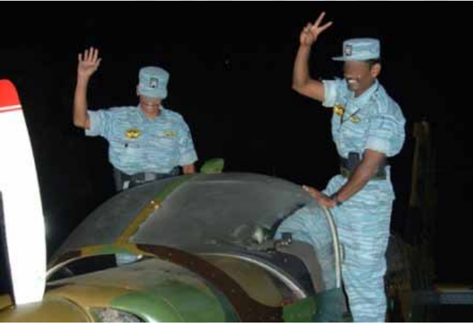
Air Tigers with their light aircraft

Second, the SLAF was instrumental in inflicting